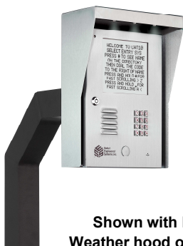
Shown with Lighted Weather hood on Pedestal