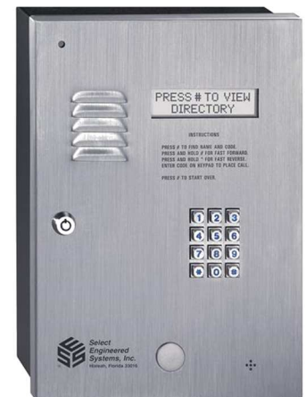
CAT 2 HF