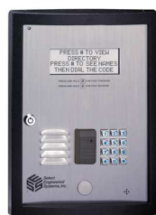
Shown with Black Designer Door Frame and HID Reader