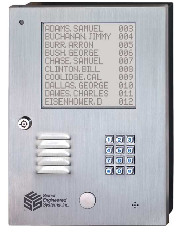
CAT 10 HF